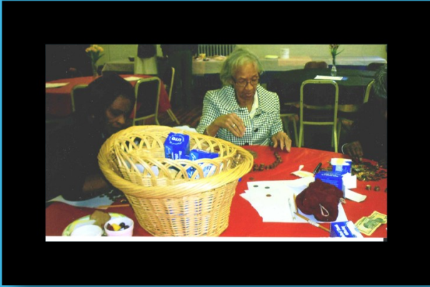
Counting our Blessings & UTO boxes!